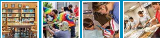
Left to right: A St. David's Neal Kocurek Scholar studies at UT; volunteers with Texas Ramp Project help construct a ramp for an elderly neighbor; a St. David's Dental Program dental assistant teaches proper brushing techniques; Meals on Wheels workers create thousands of meals a day.

For more than 90 years, St. David's has been providing top notch care for Central Texas families. In 2018, St. David's Foundation plans to invest $70M in organizations and clinics who are helping us make this the healthiest community in the world.